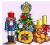
Coming Up in December