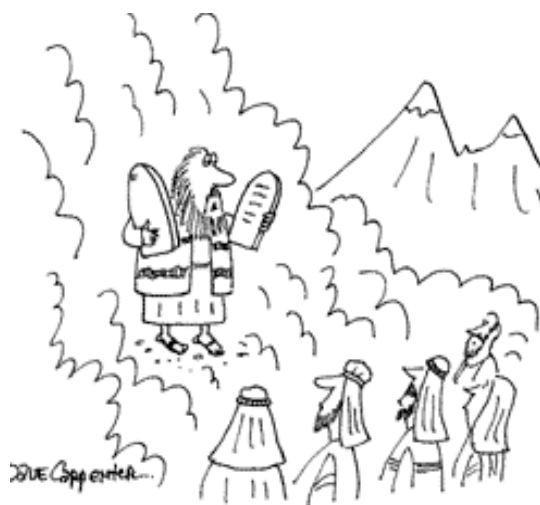
"Yes, as a matter of fact, these are extra-strength tablets."